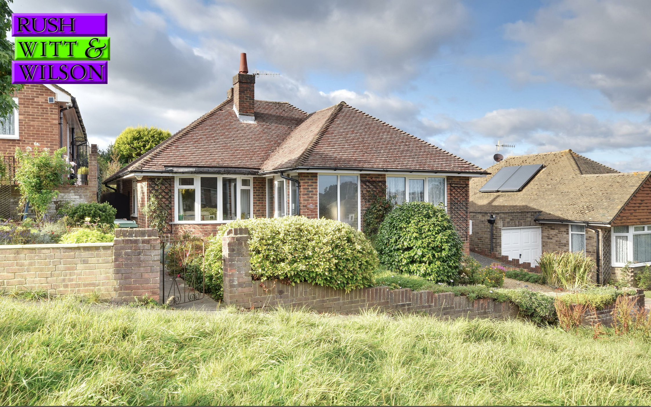
1 Chichester Close, Bexhill-On-Sea, East Sussex TN39 4DH £375,000